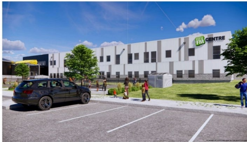
Canada Town of RENFREW Ontario MA-TE-WAY ACTIVITY CENTRE EXPANSION PERSPECTIVE OF ACTIVITY CENTRE LOOKING SOUTH-EAST - VIEW 2

There are presently 6 tenants operating their respective businesses out of the complex including: a radio station, childcare centre, chiropractic office, youth centre, gym and training centre, and the Bonnechere Algonquins First Nations.