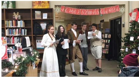
RCI students helped make our Christmas evening a success!