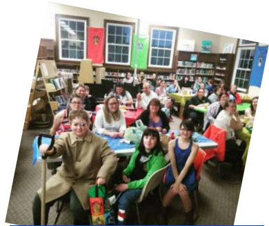
The Harry Potter Trivia Night in Apr. was a huge success!