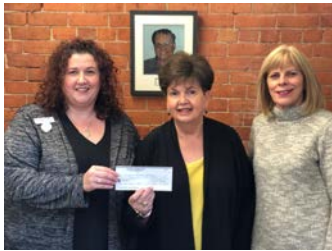
We received a generous donation from the local CFUW