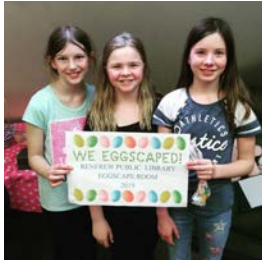
Escape Rooms were a blast!